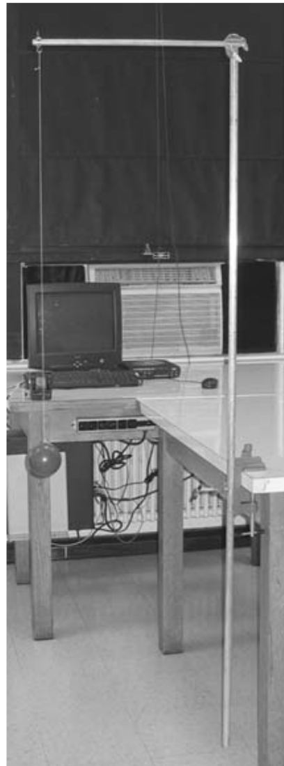
Figure 2. Pendulum setup for conservation of energy