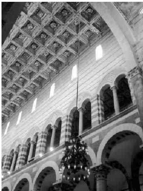
Galileo reportedly began his study of the pendulum in 1581 while watching this chandelier swing in Pisa