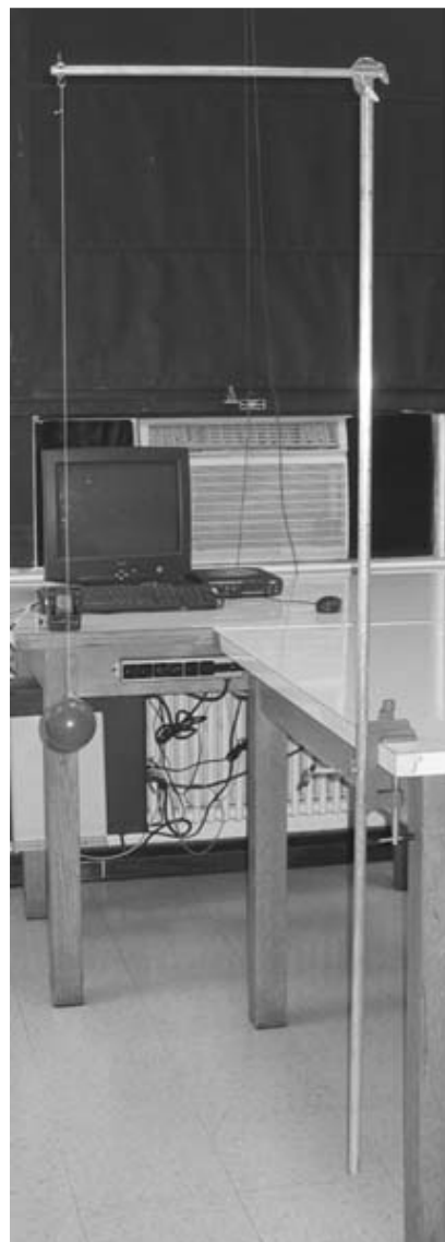
Figure 2. Pendulum setup for conservation of energy